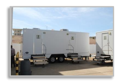
Figure 12: AV32 Restroom Trailers