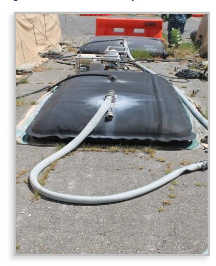
Figure 7: Water Bladders