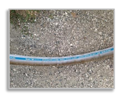
Figure 16: Hoses/Drinking Water Equipment #1