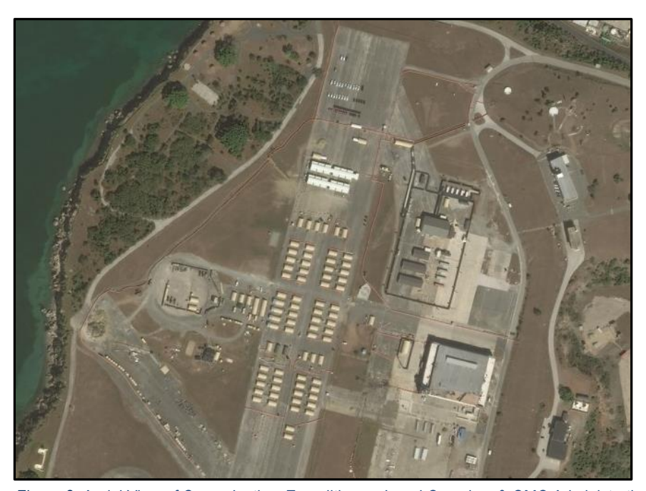
Figure 2: Aerial View of Camp Justice, Expeditionary Legal Complex, & OMC Administration Buildings (AO Patriot)

The land portion of Naval Station is enclosed by a wire perimeter fence patrolled by the United States Marine Corps Security Force Company – Guantanamo Bay (MCSFCO). NS GTMO is the hub of US military operations in the Caribbean Theater of Operations providing logistics support to the United States Navy (USN), United States Coast Guard (USCG), authorized air operations and the Joint Task Force Guantanamo (JTF GTMO). NS GTMO is populated by nearly 6,000 US service members, Department of Defense (DoD) and other government civilian employees, contract employees (from several countries) and family members of all groups.