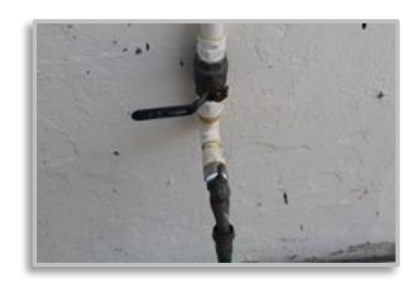
Figure 13: AV32 Spigot without Backflow Prevention Device