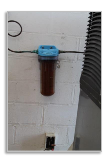
Figure 15: AV32 Bulk Ice Machine Water Filter