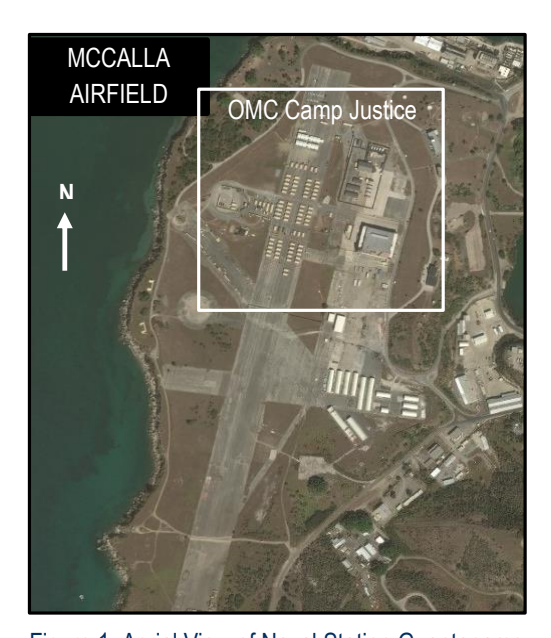
Figure 1: Aerial View of Naval Station Guantanamo

AO Patriot sits within NS GTMO. The base is located on the southeast corner of Cuba at the entrance of the Guantanamo Bay, 14 miles south of Guantanamo city as seen in the aerial view in Figure 1. The NS GTMO complex consists of the windward and leeward sides and comprises 45 square miles.