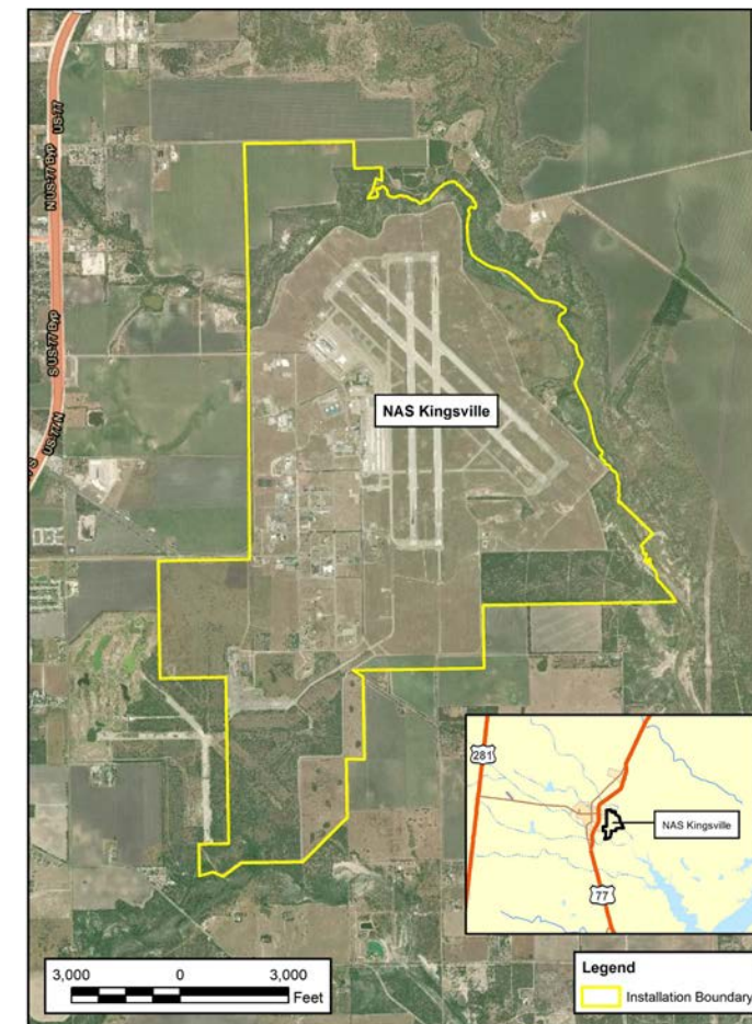
Figure 1- NAS Kingsville

PFAS are chemicals of emerging concern, which have no Safe Drinking Water Act regulatory standards or routine water quality testing requirements. EPA's lifetime health advisories are non-enforceable and non-regulatory and provide technical information to state agencies and other public health officials on health effects, analytical methodologies, and treatment technologies associated with drinking water contamination.