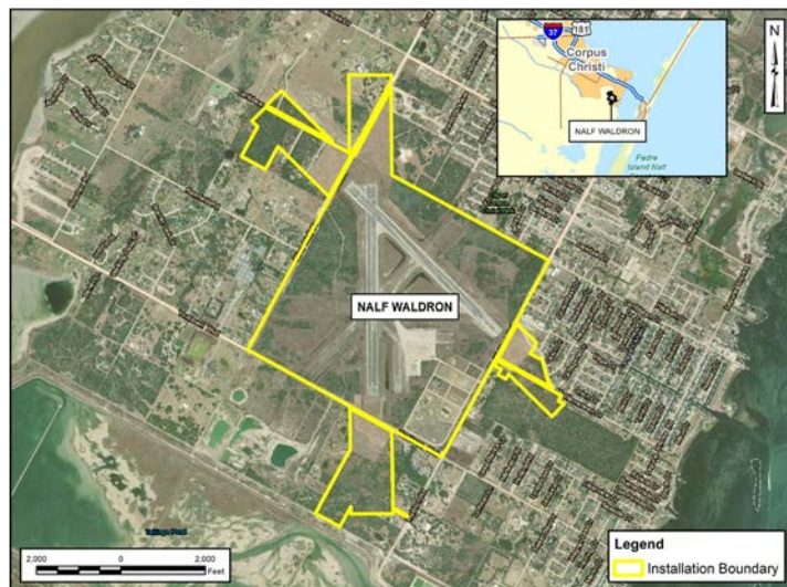
Figure 1- NOLF Waldron

PFAS are chemicals of emerging concern, which have no Safe Drinking Water Act regulatory standards or routine water quality testing requirements. EPA's lifetime health advisories are non-enforceable and non-regulatory and