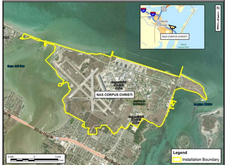
Figure 1- NAS Corpus Christi

PFAS are chemicals of emerging concern, which have no Safe Drinking Water Act regulatory standards or routine water quality testing requirements. EPA's lifetime health advisories are non-enforceable and non-regulatory and provide technical information to state agencies and