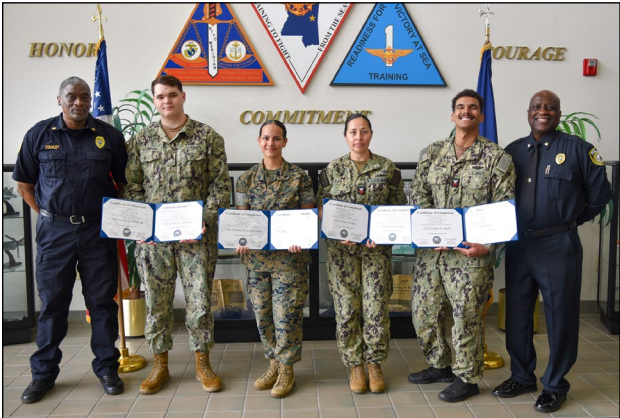
Above: Three Sailors and one Marine graduate from the Auxiliary Security Force Academy (ASF) onboard NAS Meridian, April 4. The academy is a 3-week course that provides certifications for military members to conduct security force operations as watch standers. ASF members are valuable to NAS Meridian’s Naval Security Forces on the installation and are called upon to assist when needed.