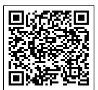
SCAN for the Captain's Virtual Suggestion Box