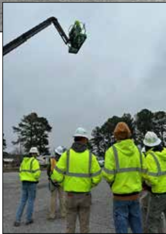
Submitted Photos Public Works Department employees receive aerial and scissor lift safety training including safety measures, equipment maintenance and proper lift usage on the equipment.