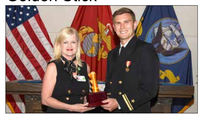
composite score achieved during training.