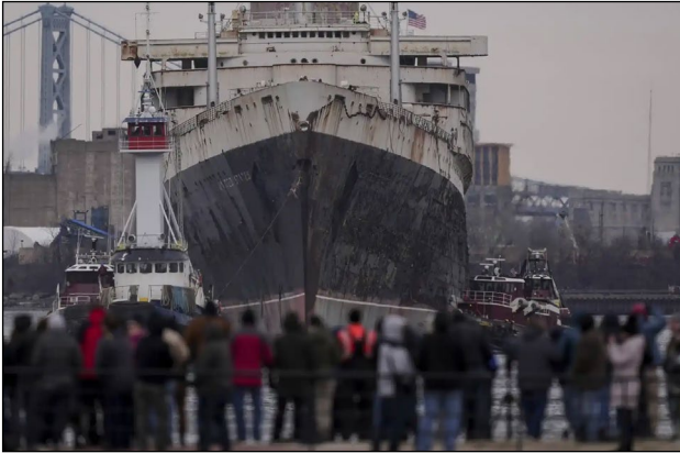
The SS United States is towed down the Delaware River between Pennsylvania and New Jersey, from Philadelphia, Wednesday, Feb. 19.

The historic, aging ocean liner that a Florida county plans to turn into the world’s largest artificial reef departed from south Philadelphia’s Delaware River waterfront on Wednesday, marking the opening segment of its final voyage. The SS United States, a 1,000-foot vessel that shattered the transatlantic speed record on its maiden voyage in 1952, is being towed to Mobile, Alabama, for planned prep work before officials eventually sink it off Florida’s Gulf Coast. The move comes about four months after the conservancy that oversees the ship and its landlord resolved a years-old rent dispute. Officials initially planned to move the vessel last November, but that was delayed due to concerns