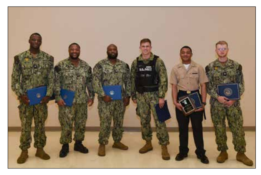
NAS Meridian personnel were recognized at Command Quarters, Sept. 24.