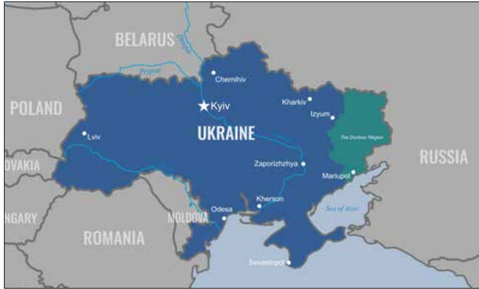
Map of Ukraine

The Zaporizhzhia Nuclear Power Plant in eastern Ukraine is currently under Russian control. According to the International Atomic Energy Agency, there is no immediate threat to nuclear safety, but that could change.