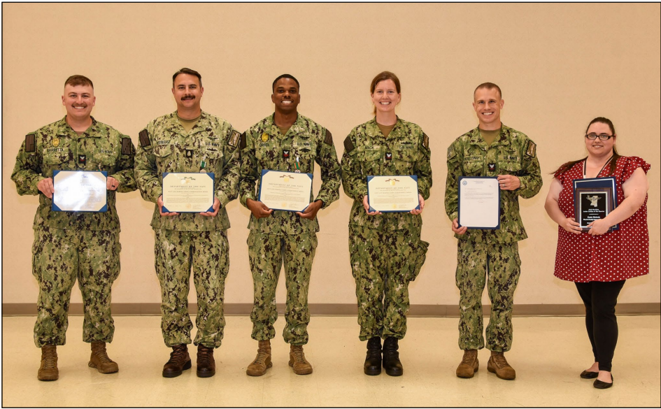
Congratulation's to those who received awards at Command Quarters, July 21. Great job and keep up the good work!