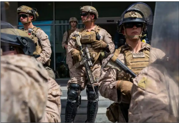
Marines are confronted by protesters outside a federal building during an anti-Trump “No Kings Day” demonstration in Los Angeles on June 14.

“The women and men of the California National