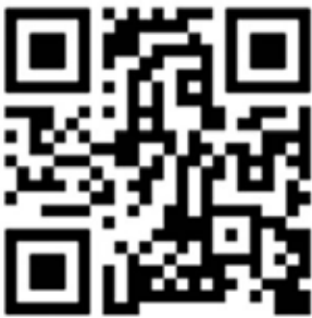
SCAN for NAS Meridian App