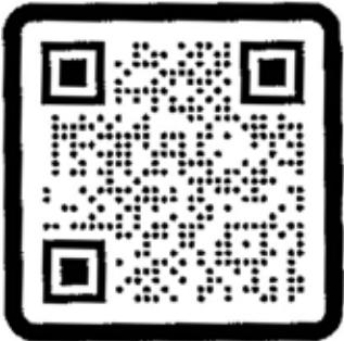
SCAN for City of Meridian App

Follow us on www.facebook.com/NASMeridian