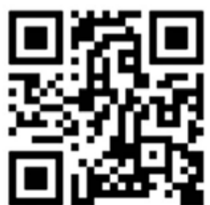
SCAN for NAS Meridian App