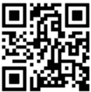
SCAN for NAS Meridian App