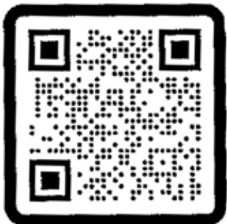
SCAN for City of Meridian App

Follow us on www.facebook.com/NASMeridian