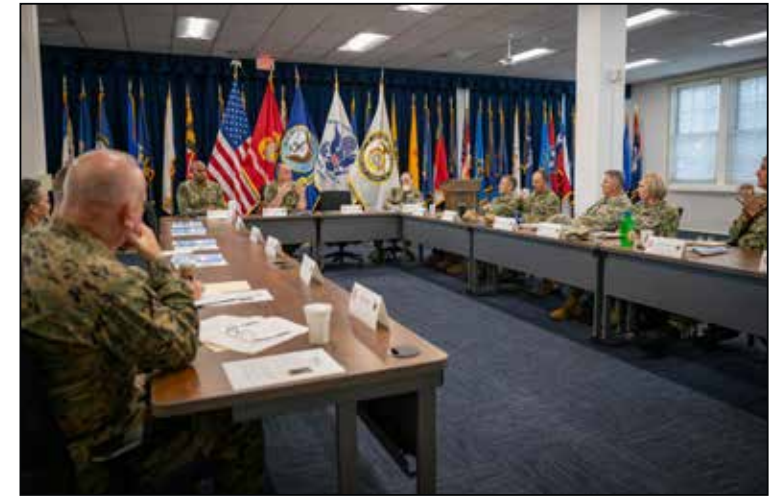
The Naval Chaplaincy School (NCS) hosts their Fleet Leadership Symposium at Naval Station Newport, R.I., Nov. 6.

Throughout the symposium, perspectives were shared from commands around the fleet including U.S. Fleet Forces, U.S. Pacific Forces, Naval Surface Forces Atlantic, II Marine